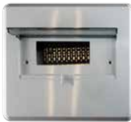
12-Way Flush Mounted

* Note: Other variations on request, including a CFL (energy saver) version bulkhead