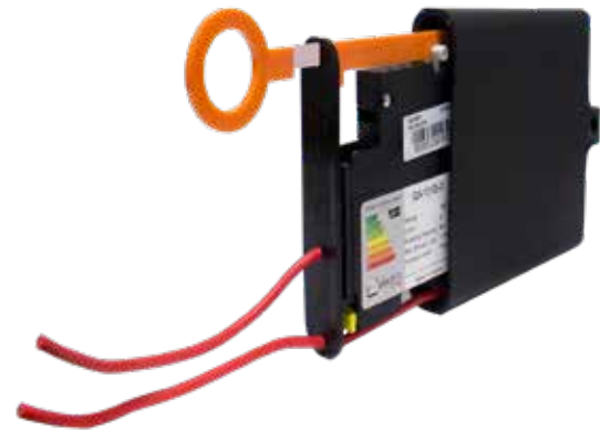
MCB not included - order separately