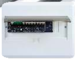
20-Way DB Board