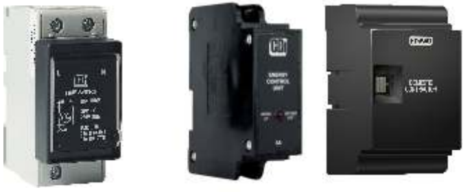
QAT-TRDM ECU SAK