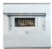
12-Way DB Board