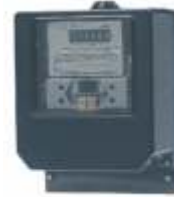
3 Phase 4 Wire (80 - 160 A)