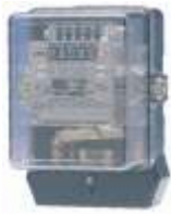
1 Phase 2 Wire (20 - 80 A)