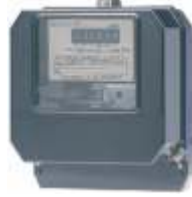
3 Phase 4 Wire (40 - 100 A)