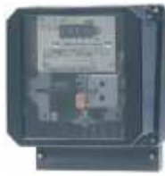
3 Phase 4 Wire (5 A)