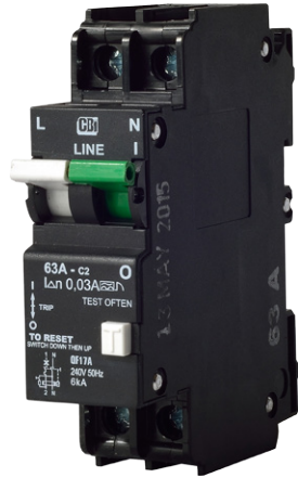
QF17A Dual Mount

The QF17 is a 6 kA earth leakage device, available as a circuit breaker as well as switch. It is black in colour and can be mounted on DIN Rail and the CBI Mini Rail. Its front escutcheon is 57 mm.