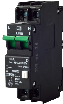
QF17C Dual Mount