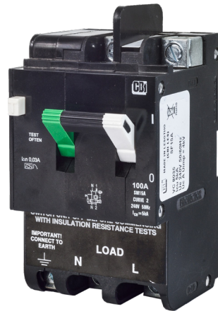
SM15A Mini Rail & Surface Mount

The SM15 is a single phase heavy duty industrial earth leakage circuit breaker available as a surface mount and CBI Mini rail mount device. This earth leakage circuit breaker is available with earth leakage sensitivity of 30, 100, 250, 500 and 1000 mA.